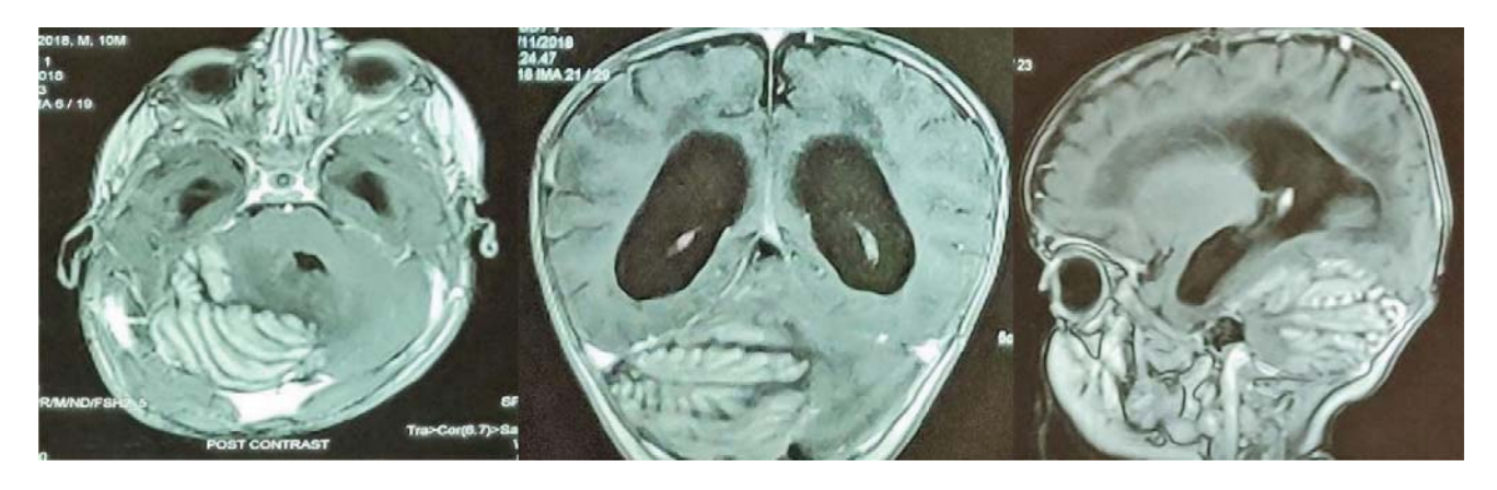
Figure 2: Post Contrast MRI showing marked gyral enhancement

occur. MRI demonstrates a low signal, non enhancement mass on T1-weighted studies. A very characteristic laminated, or folial pattern of increased signal is seen on T2-weighted scans and should suggest the diagnosis. It has characteristic striated appearance (tiger stripes) due to widened cerebellar folia. In our case, the MRI features were similar.