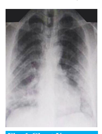
Fig. 1 Chest X-ray during admission

Patient was kept on Oxygen support with nasal pronge at 3L. Patient was given antibiotic Montaz 1gm, solumedrol 80mg, PCM 1gm(stat), enoxaparin 40mg, metronidazole 400mg in Injectable form. Vitamin supplements and zinc supplement along with Ayurvedic cough syrup (Syp crux+kasturibhusan rasa), Lianhua qingwen which is a TCM herbal medicine and cupping therapy were given.Liver tonic was also started. Vitals were monitored 6 hourly. Till day 3 patient was stable and same medicine was continued. But on the 4th day he developed shortness of breath and Spo2 dropped to 85-87%. He was