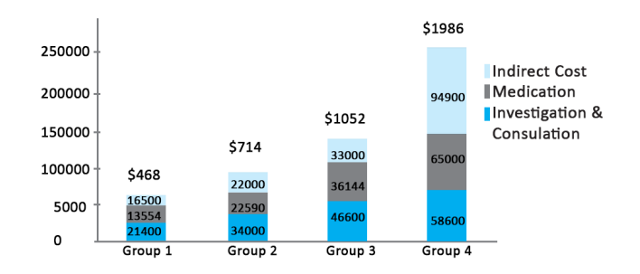
Figure 1: Group-wise overall cost of patients with NCC

Figure 1 shows the overall average cost including direct and indirect cost of the patients who were treated for NCC according to the group. The overall cost for patient in Group 1 was $468, Group 2 was $714, and Group 3 was $ 1054 and $1986 for patient in group 4. Majority of cost center was for Indirect cost i.e. 43% followed by medication cost ($30) and investigations cost ($27%) (Figure 2). Average cost per day for group 1 to group 4 was $1.73, $1.60, $1.50 & $1.10 respectively. The overall expenses per day was calculated to be $1.5.